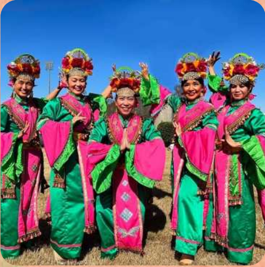
Sanggar Lestari Indonesia